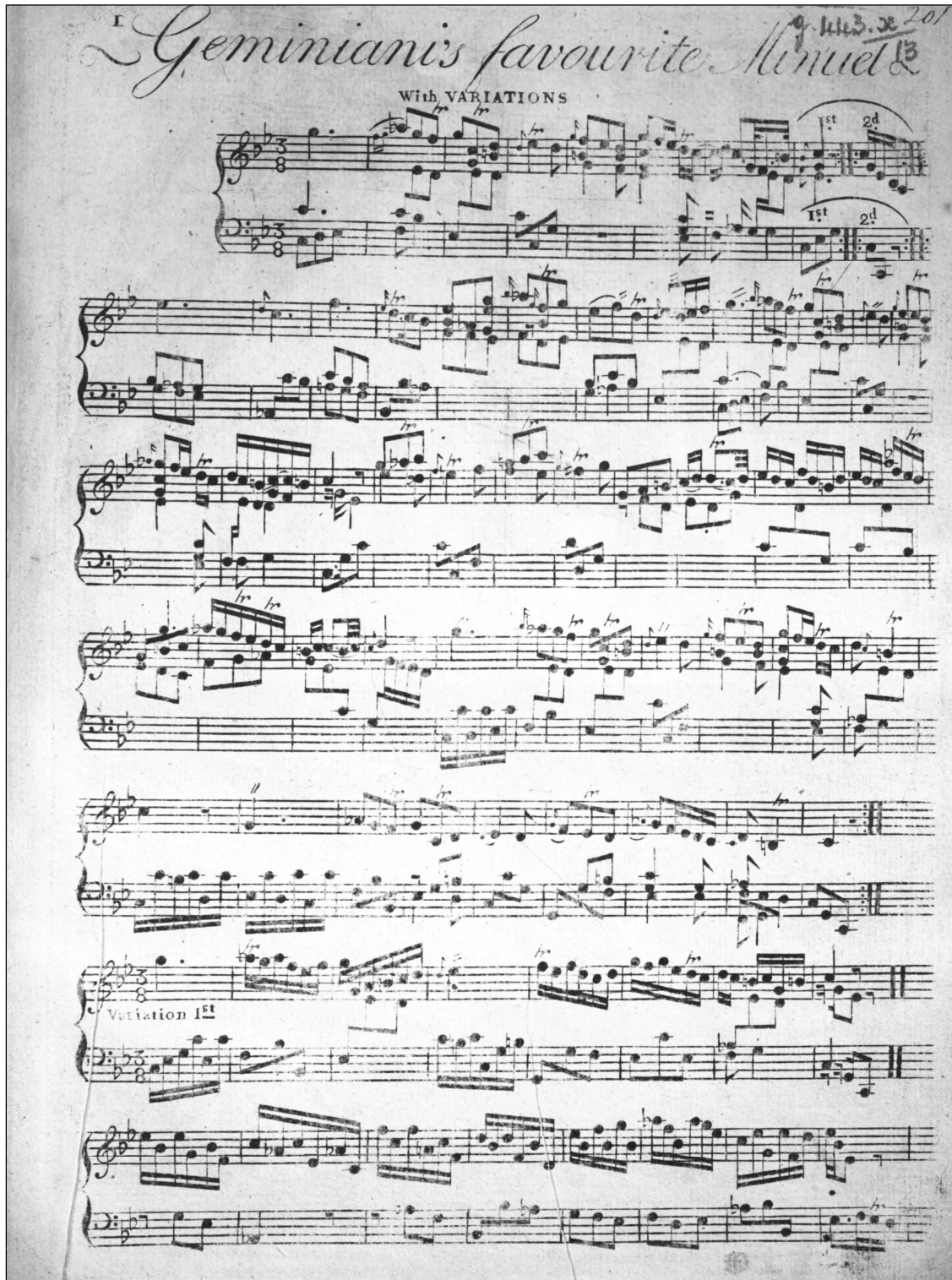
Plate 10.11. Geminiani's Favorite Minuet with Variations (London: Longman, [c. 1768]) = Minuets with Variations, Sixth (Third Separate, Longman) Edition Page 1 (Copy GB-Lbl, g.443.x.(13))